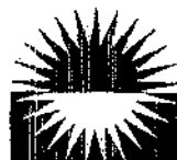
Home & Deco