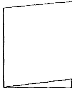
After 1 fold